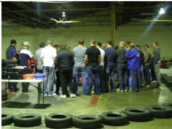
The large Formula Vee contingent gets briefed.