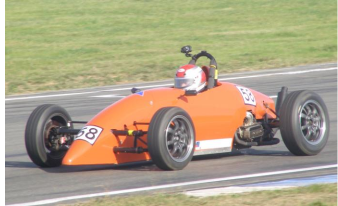
Leigh needed youth pills by the last race