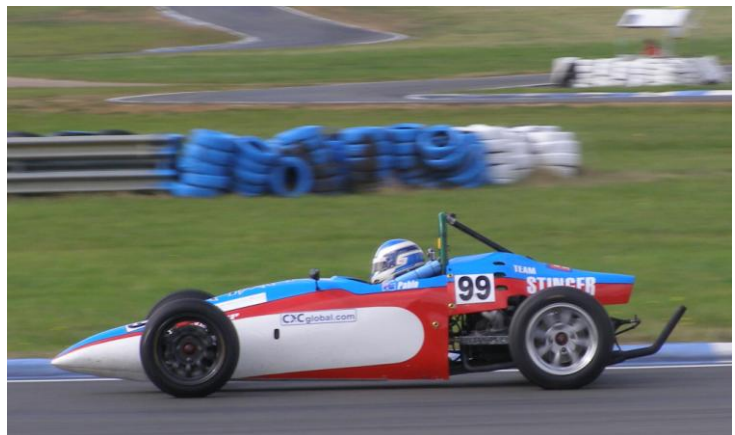
Pablo had a few Stinger problems, but made progress