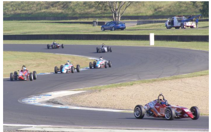
Can't be Hooky. He must be in the paddock with problems!